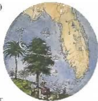
Painting of Florida's first state seal, used ca. 1846-68

In the 1860 presidential election, no Floridians voted for Abraham Lincoln, although the Illinois Republican won at the national level. Shortly after Lincoln's election, a special convention drew up an ordinance of secession, and Florida seceded from the Union on January 10, 1861. Within several weeks, Florida joined with other southern states to form the Confederate States of America.